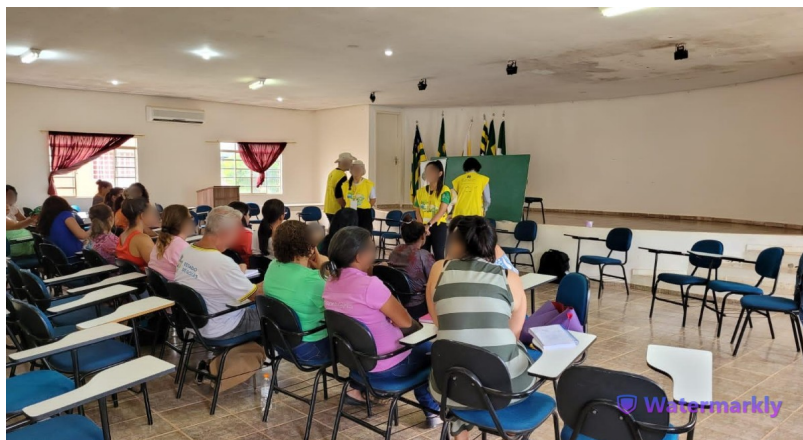
Figura 6: Training workshop for teachers "Prevention Workshop and Combating child sexual abuse