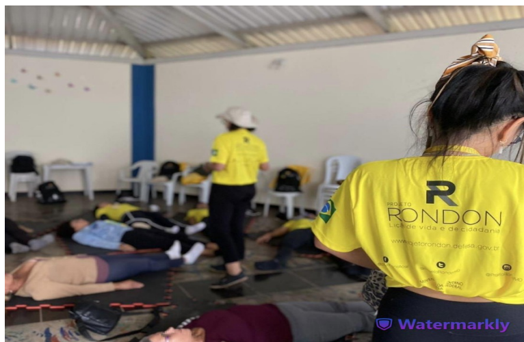
Figura 7: "Yoga and Meditation" - CRAS (Alto Paraso/GO)