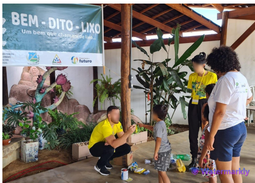
Figura 4: “Toy Workshop with recyclable material”

Self-directed violence and suffering in adolescence – with 71 participants, it was carried out on 01/25; 01/27; 01/30; 02/01 and 02/02/2023, the rondoners sought to accommodate the demand of students and teachers about suffering in adolescence and self-directed violence, the workshops took place in the form of a conversation circle.