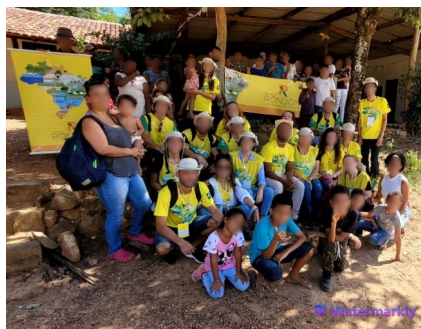
Figuras 1 e 2: UFGD rondon volunteers and UNIFENAS in Alto Paraso