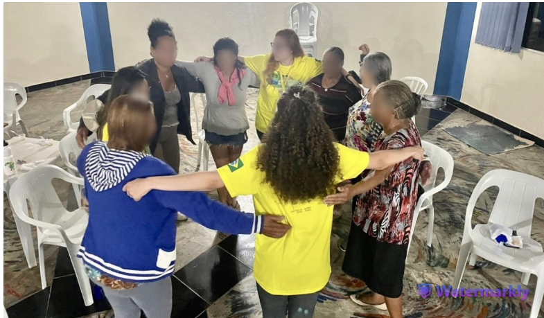
Figura 5: "Women of Fiber" Workshop - CRAS