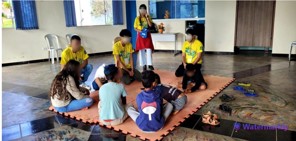
Figura 8: Comic financial education workshop - CRAS (Alto Paraso/GO)