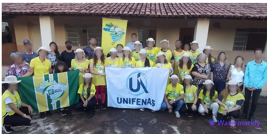
Figura 09: Rondon Project: UFGD and UNIFENAS team in So Jorge