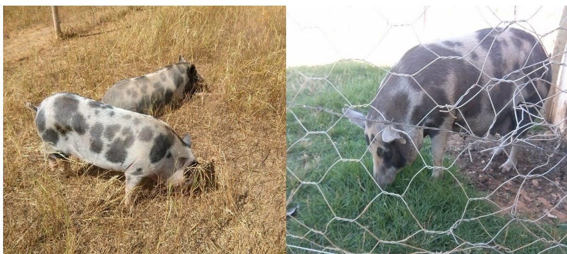
Figure 3. Animals implanted in the core farm

In the first year, the genetic nucleus was implanted with the involvement of the cooperative settlers of the Veredas da Terra Cooperative, in parallel with the performance of training, where they had the opportunity to acquire technical knowledge about zootechnical data and agroecological management of pigs, as well as about the appropriate facilities (Figure 3).