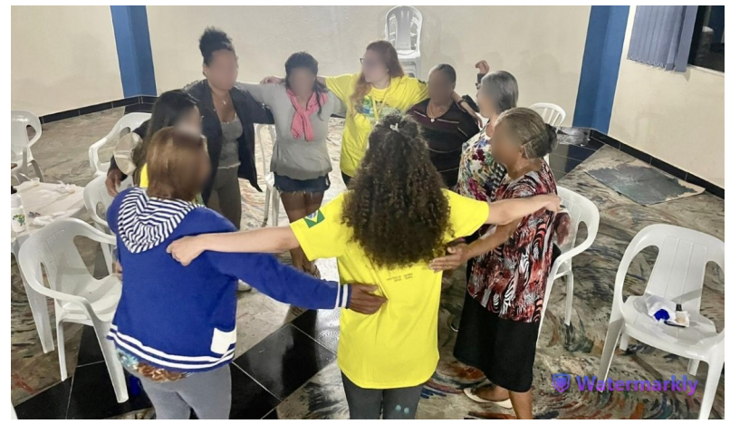
Figura 5: "Women of Fiber" Workshop - CRAS