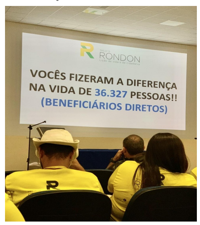
Figura 10: Closing Ceremony - Rondon Project "Lobo Guará Operation"

To the team, we want to express our gratitude for having had the opportunity to work in the operation in the municipality of Alto Paraíso de Goiás and in the adjacent communities. These places really are rich in natural beauty, and the people we meet there are truly inspiring and admirable.