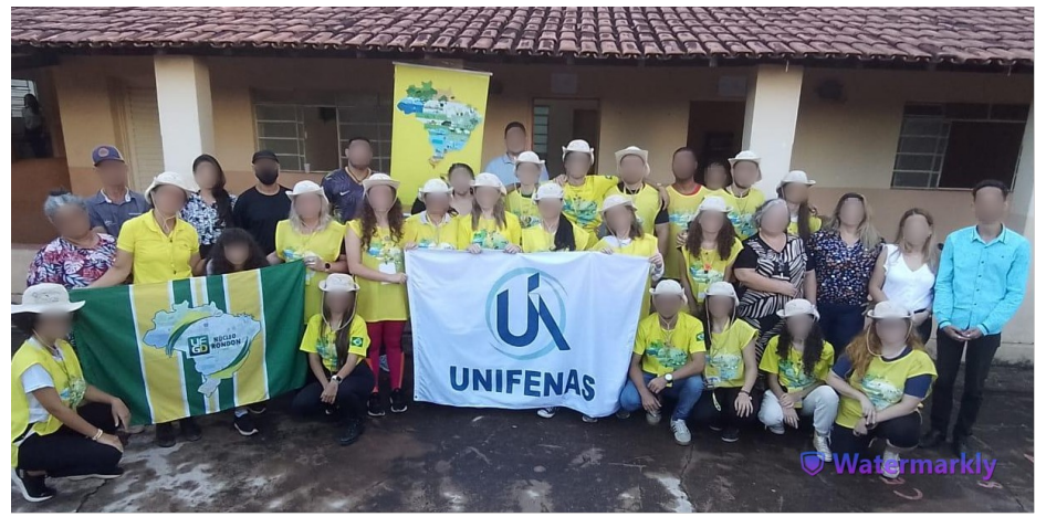
Figura 09: Rondon Project: UFGD and UNIFENAS team in São Jorge