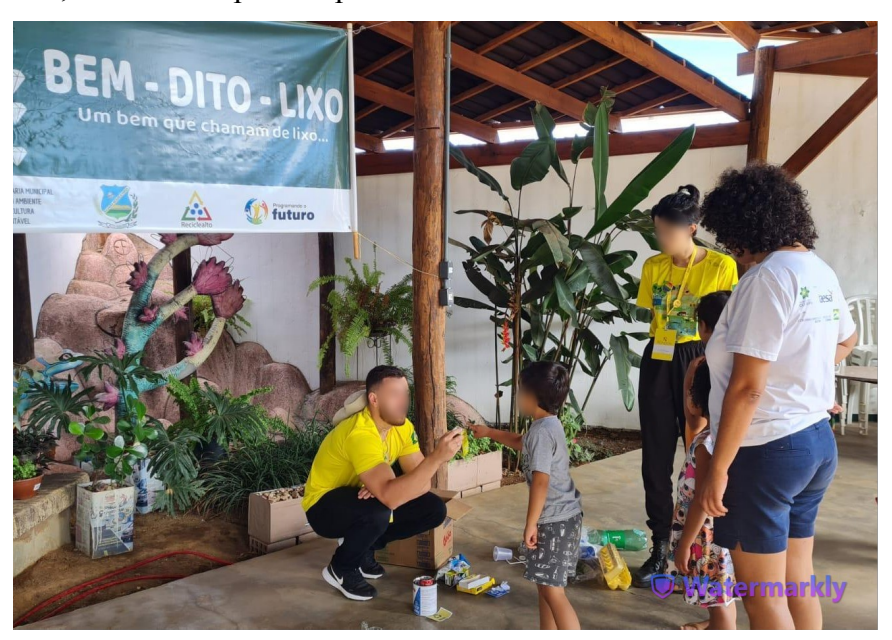
Figura 4: "Toy Workshop with recyclable material"

Self-directed violence and suffering in adolescence – with 71 participants, it was carried out on 01/25; 01/27; 01/30; 02/01 and 02/02/2023, the rondoners sought to accommodate the demand of students and teachers about suffering in adolescence and self-directed violence, the workshops took place in the form of a conversation circle.