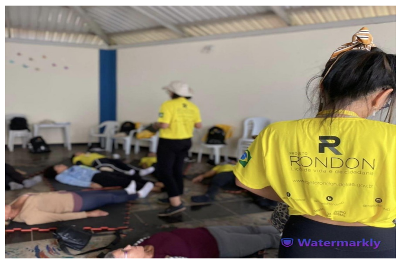
Figura 7: "Yoga and Meditation" - CRAS (Alto Paraíso/GO)