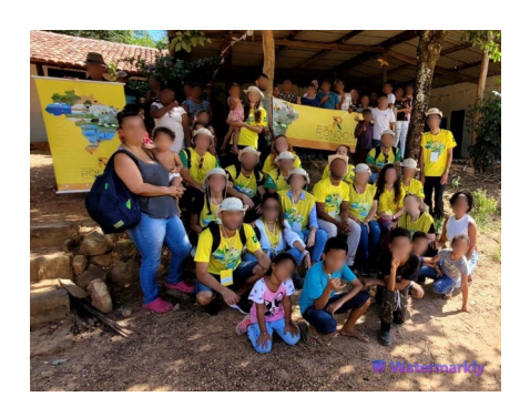
Figuras 1 e 2: UFGD rondon volunteers and UNIFENAS in Alto Paraíso