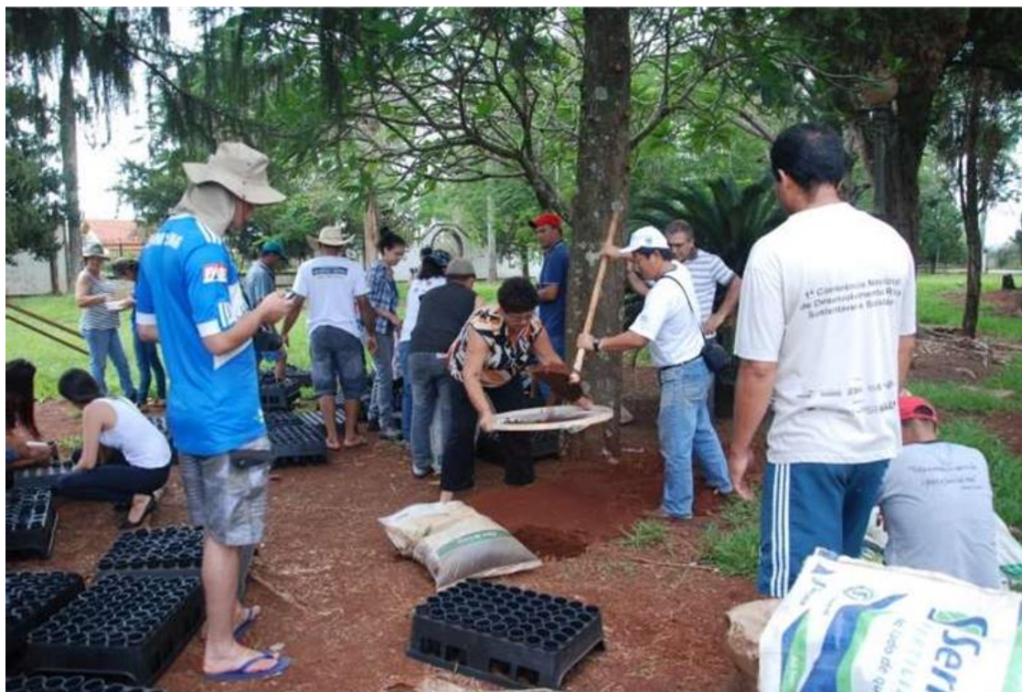
Figure 5. Agrarian Residency Course at the Eldorado II Study Base.

In the following year, the place was also made available by UFGD for the execution of some activities. Together with SENAR, it offered courses on: Correct Handling of Agricultural Defensives, Cultivation of Passion Fruit; Breads and Cakes and; Management for Women of the Settlement. With SENAI, the Professional Sewing course. Through SEBRAE, the courses of: Entrepreneur in the Countryside; Costs to Produce in the Field and; Concepts of Homeopathy in Agriculture. Together with the Brazilian Agricultural Research Corporation (Embrapa), the course on Rapid Participatory Diagnosis in the Production of Vegetables and Fruits in an Organic Production System. Finally, together with the Secretariat for Integrated Development (SEMDI) of Nova Andradina, the course on Improvement and Transformation of Products Derived from Cassava and the meeting to publicize the Support Program for Family Fish Farming.