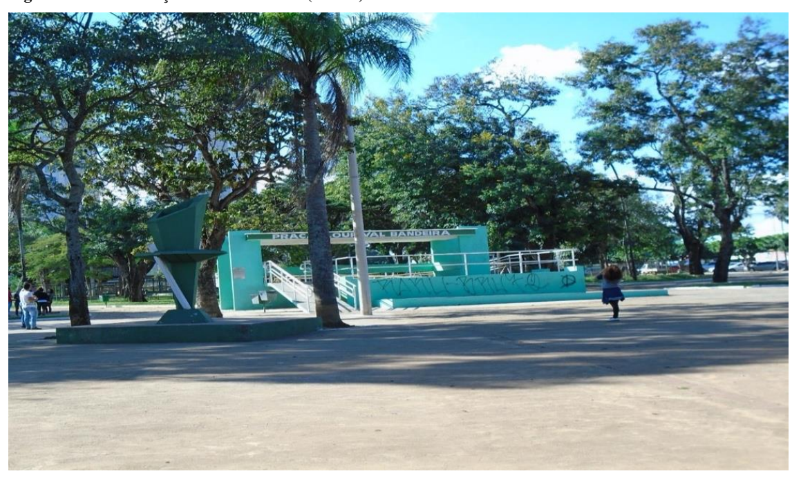
Figure 3 - View of Praça Lourival Bandeira (Field 2)