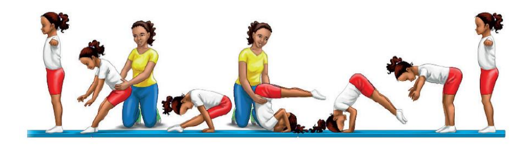
Figure 4 - Image of the teacher who actively participates in the class – Gymnastics