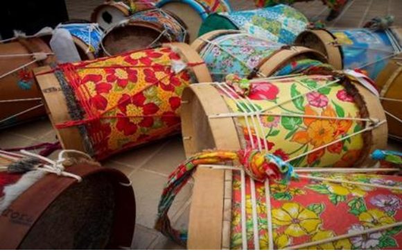
Figure 4 – Boxes of the Divine