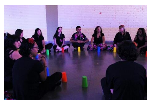
Figure 1 – Teachers in wheel for percussion with cups

As mentioned earlier, this experience refers to a class shared by four educators. For methodological and thematic reasons, this class was divided into two moments. At each moment a duo was responsible for conducting the work. It is noteworthy that the students who participated in the class were the same in all moments of activities, and the four teacher-trainers were present throughout the period and participated in all proposals. To start the activity, we presented images to raise interactions through interpretations and, only after the speeches, feelings and observations made by the people who participated, revealed the complete image. | 12 Cristina Aparecida Leite brought two: