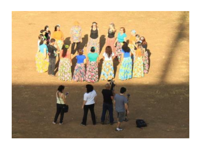
Figure 2 – Teachers on wheels for recording cirandas activity