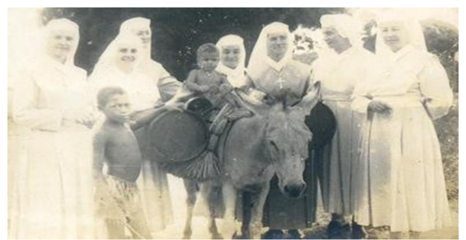
Figure 5 – Sisters of the Assumption with children selling water, 1957

Many went there to escape abandonment and poverty, since most of the boys from poor families, when they were not fishermen, were water carriers and sold this wealth so difficult in some localities for the survival of the families to which they belonged.