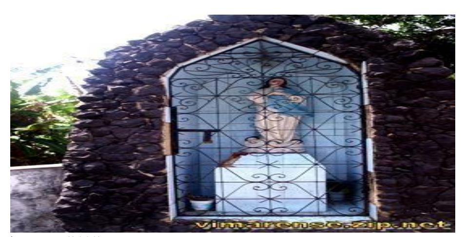
Figure 1 – Monument in honor of Our Lady of the Assumption

Oliveira (2000, p. 47) records a great enthusiasm of the population with the arrival of the Canadian Mission in the 1950s and with the improvements that they could bring, not only in the spiritual plane, but in the educational and infrastructure plan of the city, in times of increase of the "[...] debauchery and poverty."