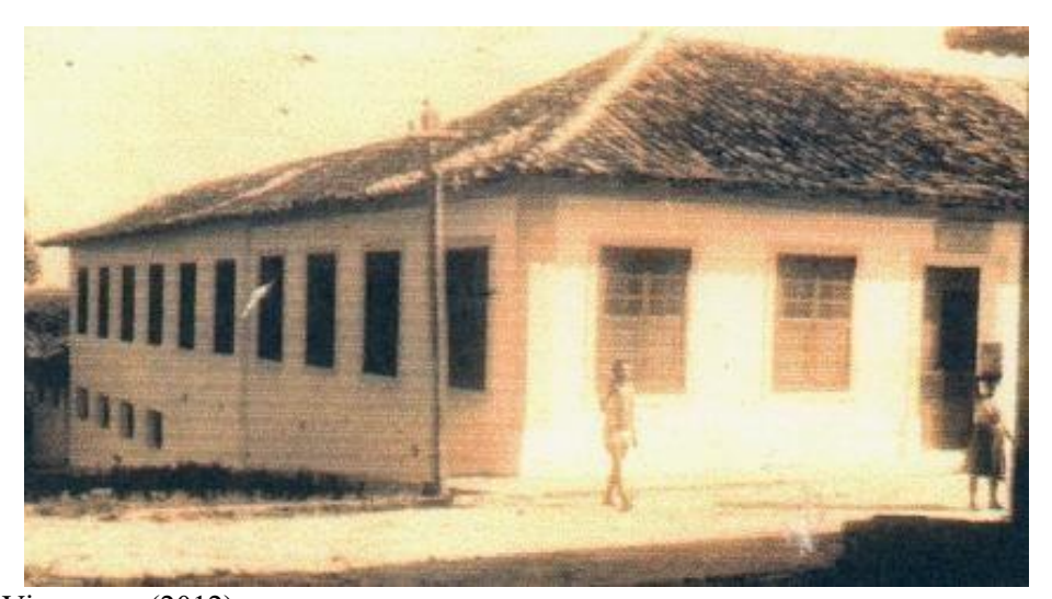
Figure 3 – Facade of the Convent of the Sisters of the Assumption in Guimarães

They were the mediators of the welfare actions that, through a philosophy of solidarity and breaking sin, injected teachings about the need to cultivate the fear of God and to follow the mission of Jesus on earth and, especially for women, to achieve the Marian ideal of obedience to their husband.