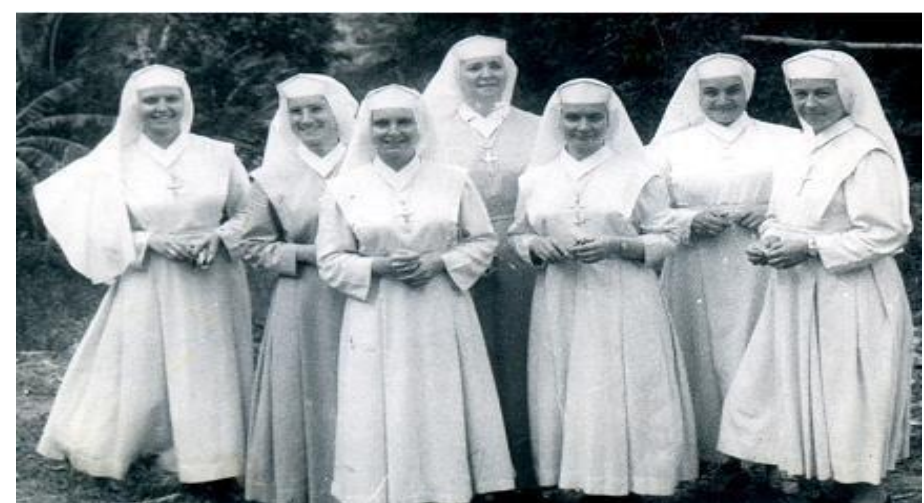
Figure 2 – Arrival of the Sisters of the Assumption in Guimarães in 1957

In these rural communities, mostly made up of blacks, religious and welfare services were taken to their satisfaction, given the existence of saints of "diabolical religions" – as the Afro-descendants were called – who were camouflaged by the Catholic images on the altars of the cafuas of black families (OLIVEIRA, 2000).