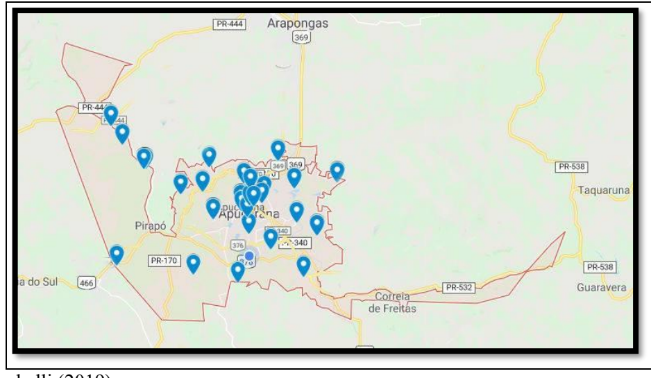
Map 1 – Location of rural schools in Apucarana

Between the years 1940 to 1990, Apucarana had an amount of 90 rural isolated schools, which offered primary education and a school for rural workers. The context of agricultural economy reveals the creation, also justifying the expansion of these schools, some localities had a higher concentration of establishments, such as the Estrada do Rio do Cerne and Água do Xaxim (entrance of the Brazilian Coffee Institute) with 27 schools, the Barra Nova Road (Estrada Nova Ukrânia) were listed 13 schools, on the Estrada do Rio Bom – PR 539 with ten schools; these numbers show the number of resident workers and the number of resources deployed, whether they come from rural landowners, public funds or the community, however the localities show varied information (SACCHELLI, 2019).