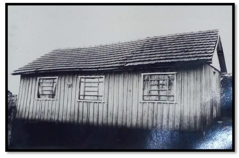
Figure 2 – Ana Nery Rural School (1957)

The field of research on the historiography of school institutions is recent and aims to meet the demands of knowing the educational specificities. Rural schools at this juncture were far from the urban pattern. Figure 2 depicts the photograph of the Ana Nery Municipal Rural School, located on the Bom Rio Road, built in 1957.