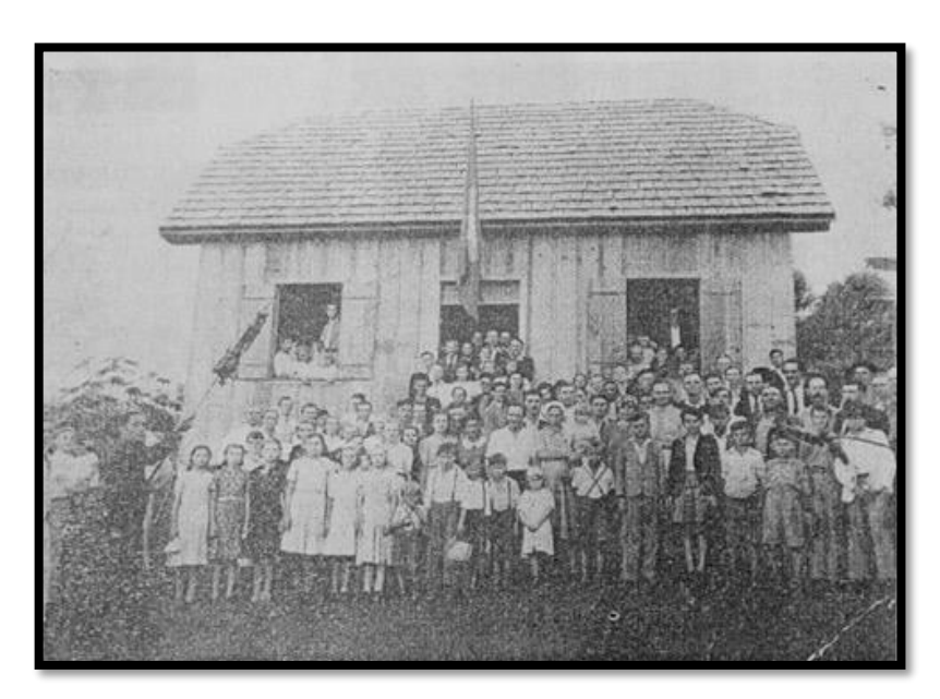
Figure 1 – Inauguration of the New Ukraine School

According to Aksenen and Miguel (2017, p. 801) "The influence of immigrants also extended to the educational domains, since they created in their nuclei, where there were no public schools, subsidized schools." The history of the process of colonization of the State is mixed with the history of the formation of the first educational institutions, as we can see in Figure 1, which depicts the inauguration of the New Ukraine School, in Apucarana, in 1941.